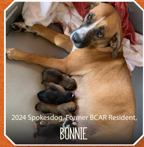
2024 Spokesdog, Former BCAR Resident,