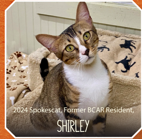
2024 Spokescat, Former BCAR Resident,